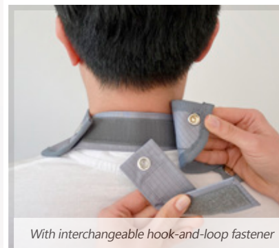
With interchangeable hook-and-loop fastener

Note: In order to meet hygiene requirements, we recommend that you use our washable hygienic cover made from special ComforTex® MF material "Titan" colour.