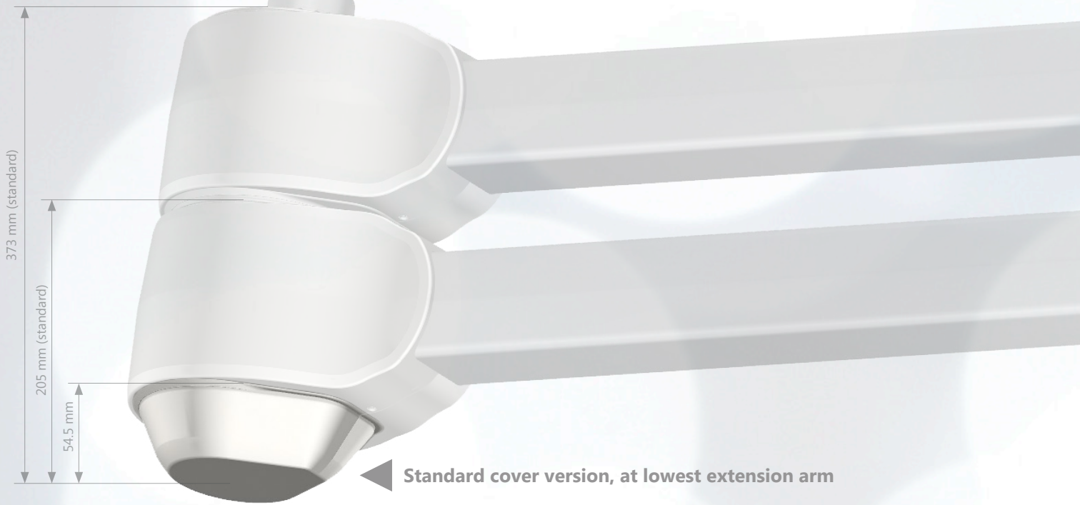
Standard cover version, at lowest extension arm