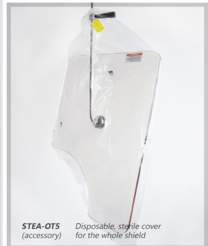
STEA-OT5 (accessory) Disposable, sterile cover for the whole shield

Article Codes: OT50001I Shield complete with Portegra2 Suspension Arm (extension arm length 75 cm) E-OT25B05I Replacement Shield and Connection Bar