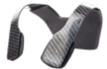
BRYGGA Shoulder Relief