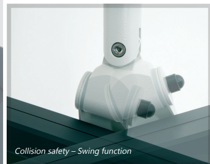
Collision safety – Swing function