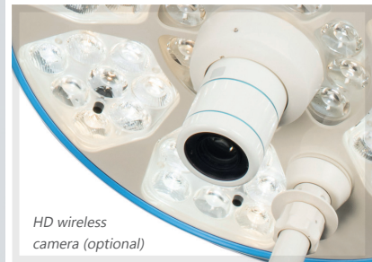
HD wireless camera (optional)