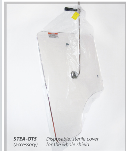
STEA-OT5 (accessory) Disposable, sterile cover for the whole shield

Article Codes: OT50001 OT90001 E-OT25B05