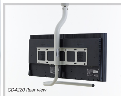
GD4220 Rear view