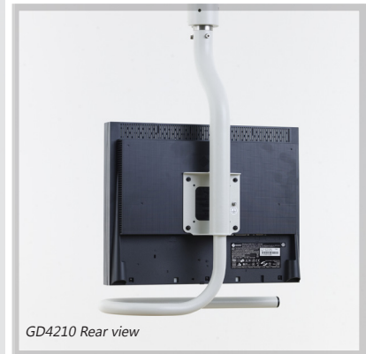
GD4210 Rear view