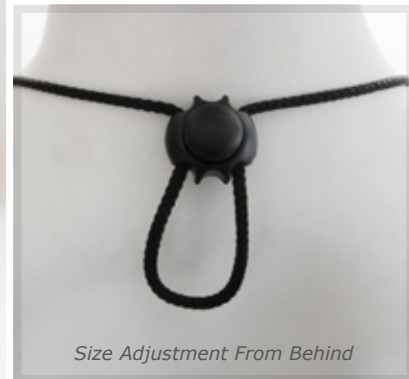
Size Adjustment From Behind

Model: RP27156231 Mammary Gland Cover for Children