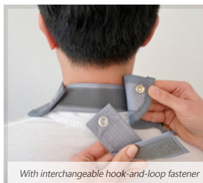
With interchangeable hook-and-loop fastener