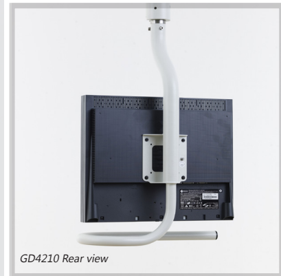
GD4210 Rear view