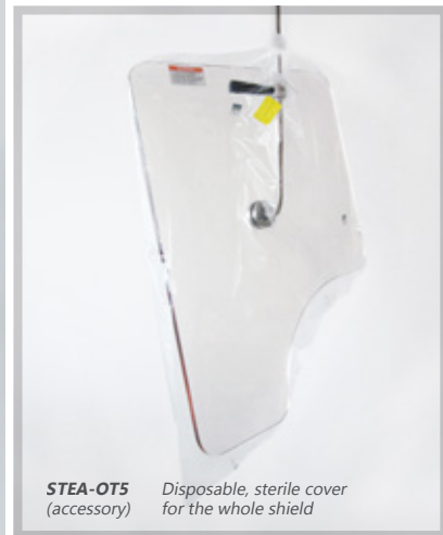
STEA-OT5 (accessory) Disposable, sterile cover for the whole shield