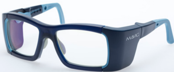
BR330 radiation protection glasses without dosemeter connection (Ocean Blue style shown)