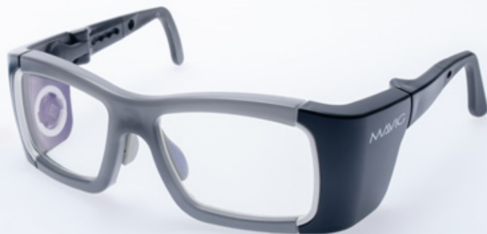
BR330 radiation protection glasses with right side dosemeter connection (Obsidian Grey/Black style shown)